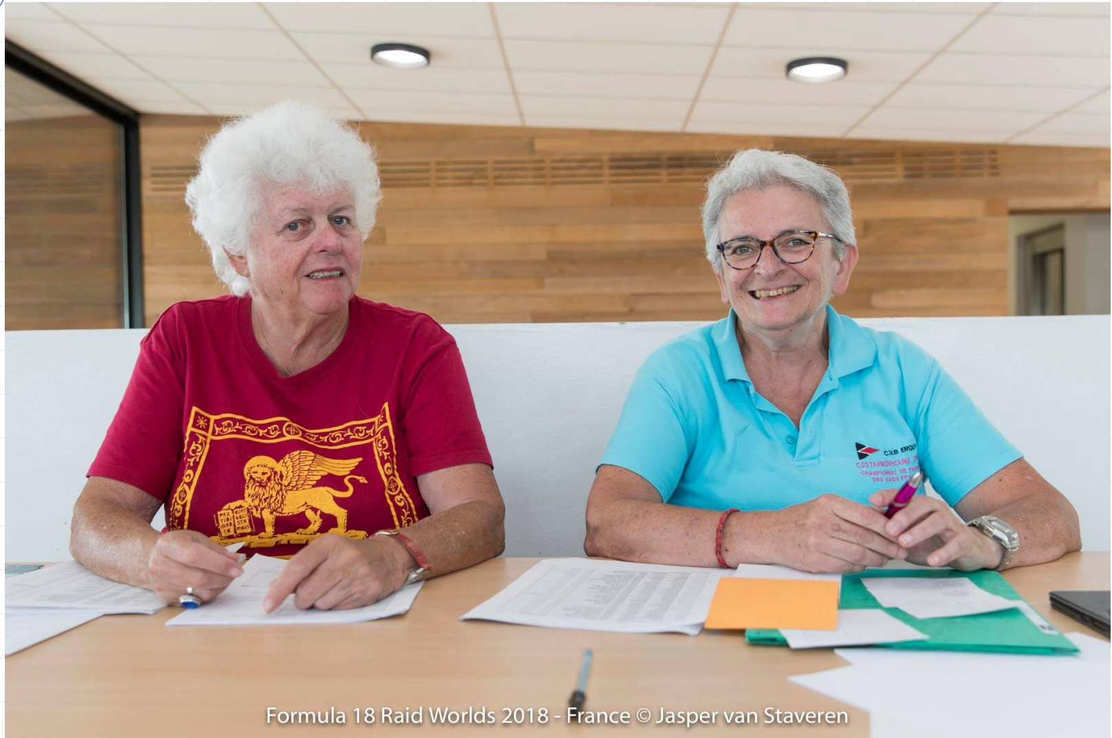
Formula 18 Raid Worlds 2018 - France