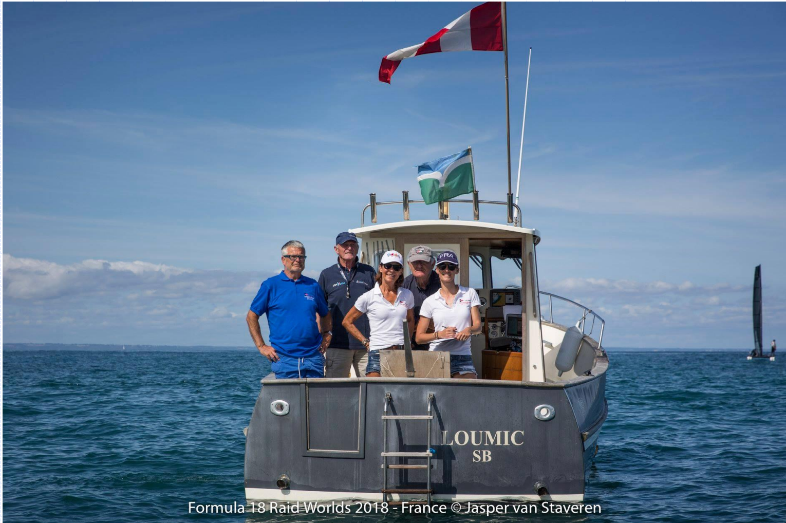
Formula 18 Raid Worlds 2018 - France