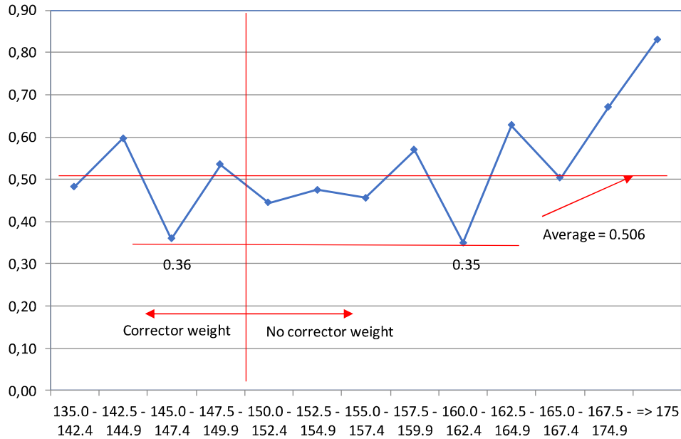
Average relative ranking