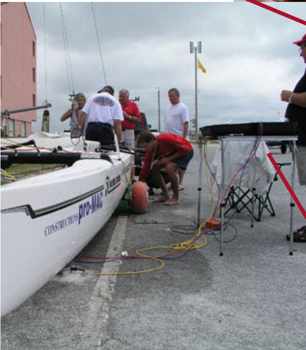
Left: Each cell connects to the digital read out shown upon the table.