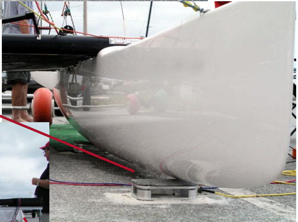
Right: Close-up of load cell with hull on it..