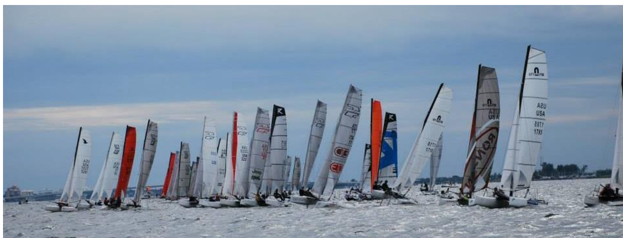
Start line at the 2013 F18 Americas Championship Regatta – Hosted by the SSS