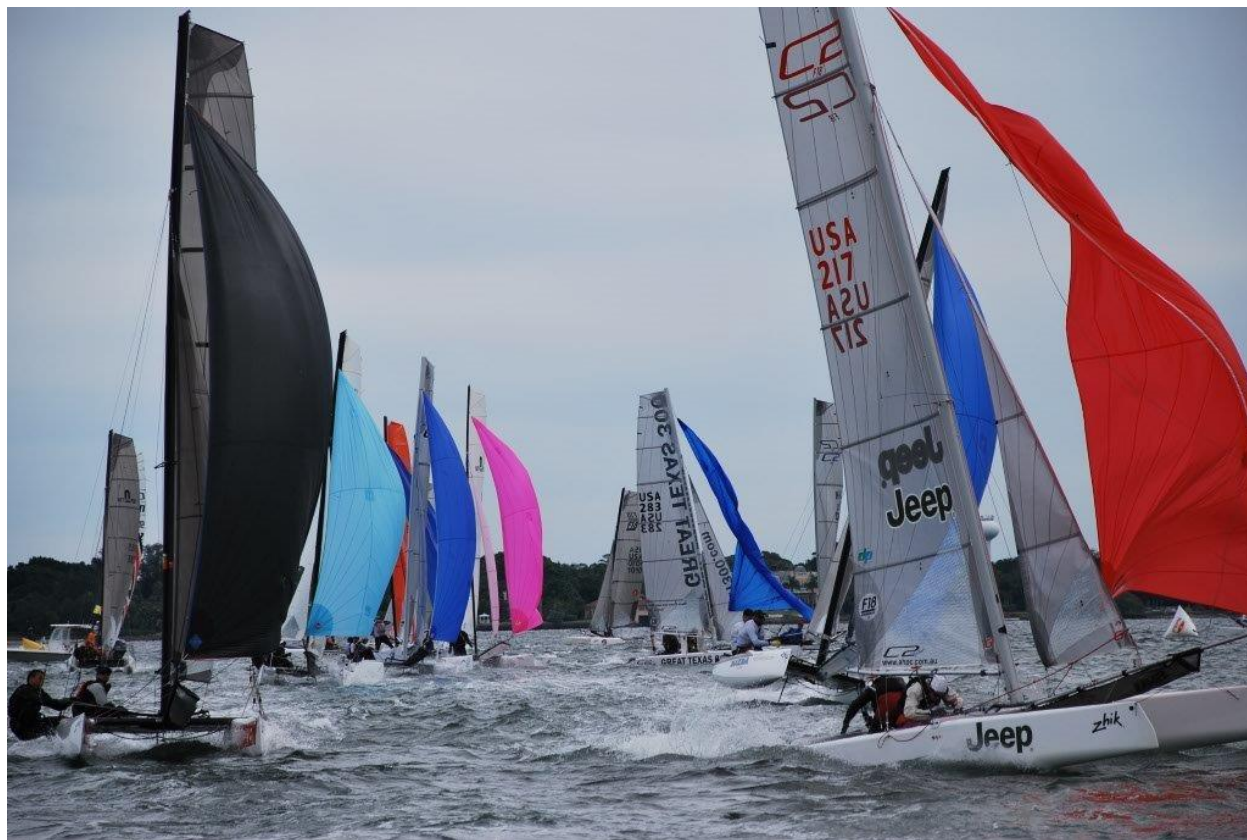
On the course at the 2013 F18 Americas Championship Regatta – Hosted by the SSS

Ed Baird, America's Cup Winner, multiple world champion, ISAF World Sailor of the Year