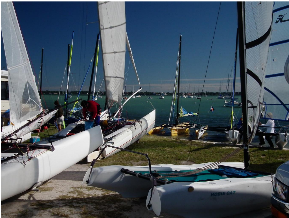
Easy Beach Launch Area